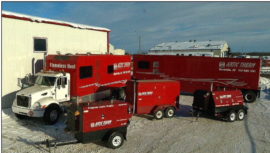
FIGURE 3: ARTIC THERM UNITS RANGING FROM 500,000 TO 3,000,000 BTUS