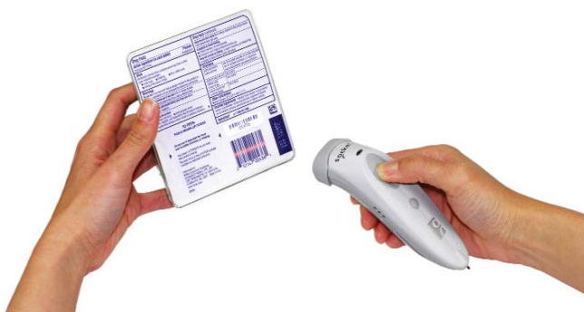
Deploy out of the box with barcode scanners or other peripherals from Socket.

The SoMo 650 provides a stable, affordable base platform for application development which you can later enhance with Auto ID and wireless broadband as deployment needs evolve. This flexibility provides a cost-effective alternative to deploying an expensive device overloaded with features that your business may not be ready to use.