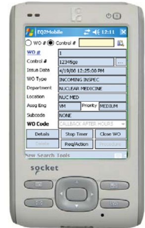
SoMo 650Rx with Antimicrobial Protection

Also available: SoMo 650DX (Radio-free Configuration)